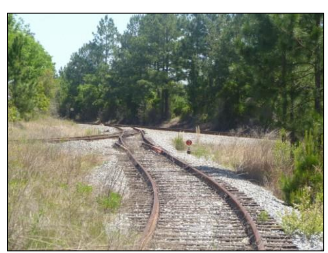
Property is located on Norfolk Southern's main rail line with a passing track within a mile of the plant.